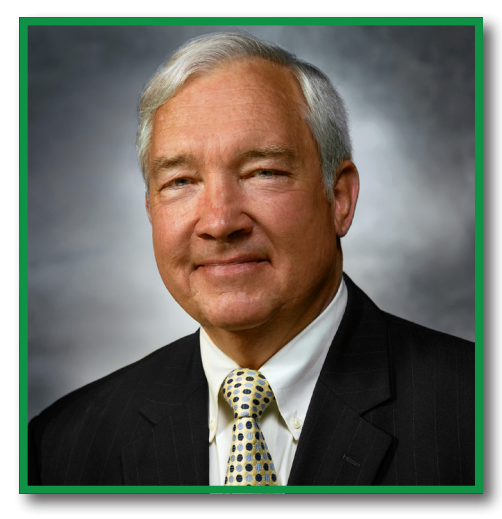
State Representatives to oppose this legislation.

Ongoing in the Missouri Legislature are several pieces of legislation that could be very impactful or threatening to the revenues we depend upon to pay for the services our city provides. Among these are Senate Bills 526 and 529. SB 526 relates to the dramatic reduction of cable utility franchise fees that local government has historically and customarily received as a part of their annual revenues. Obviously, we are adamantly opposed to this bill, as it could reduce our revenues from this source by as much as 80% or more. Please consider asking our State Senators and